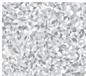
Galvalume TSR 25%